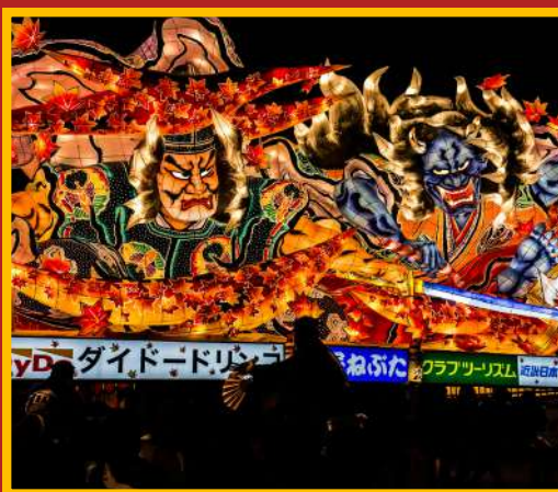
Aomori Nebuta Festival