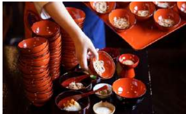
Wanko Soba Lunch