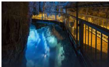
Ryusendo Cave - Iwate