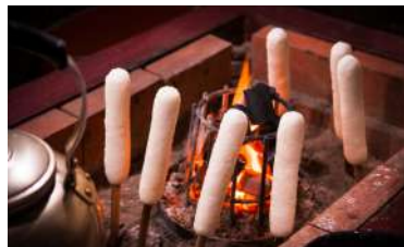
Kiritanpo (rice skewers) making