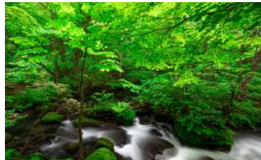
Oirase Keiryu Stream - Aomori