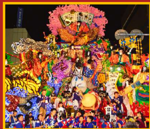
Hanawa Bayashi Festival