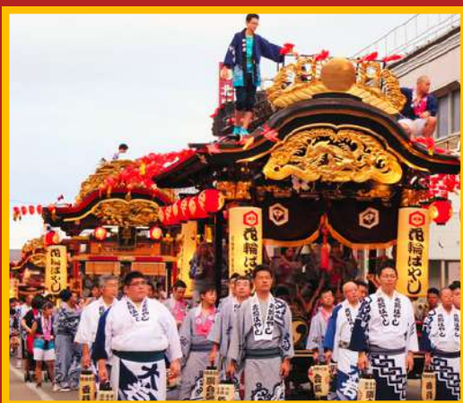
Hachinohe Sansha Taisai Festival

Travel in Comfort with a Small Group of 20 – Reserve Your Place Today!